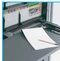
Roll out reference shelf