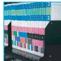
Lateral shelving and dividers