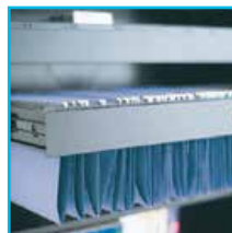
Roll out file frame